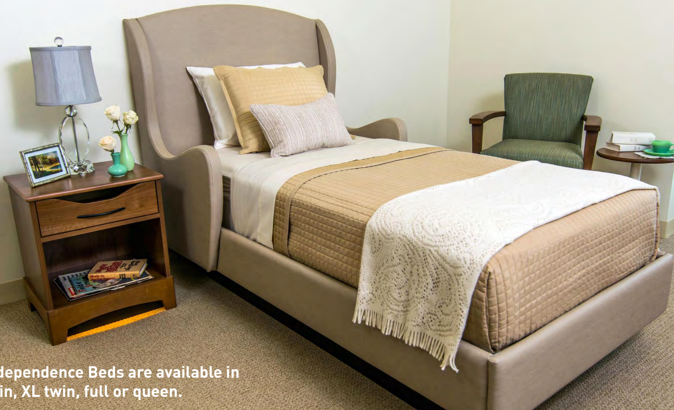
Independence Beds are available in twin, XL twin, full or queen.

The Patented Independence Bed facilitates unassisted transfers to support independence.