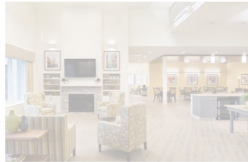
Abe's Garden Arts and Lifelong Learning Household

The centrepiece of Abe's Garden's residential memory care community is a well-planned, secure and stimulating, central courtyard that is easily accessible from each household, providing residents the opportunity to independently interact with nature. The courtyard has several engagement areas, including a walkway, outdoor kitchen, raised garden beds, hummingbird feeders, and a water feature. Weather permitting, residents are invited to engage there daily.