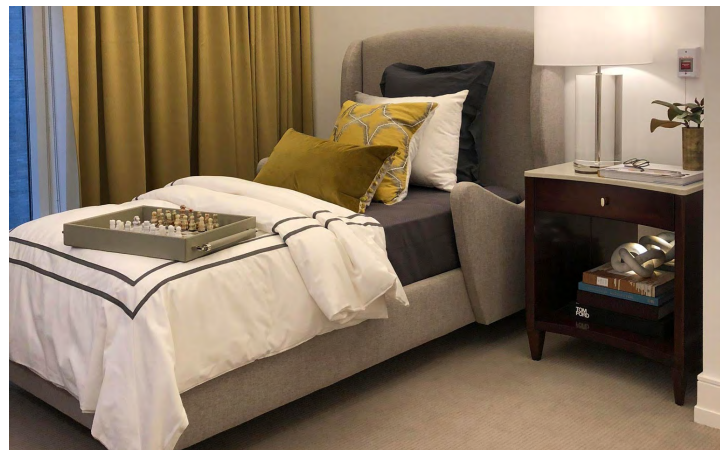
As seen at Sunrise Senior Living flagship East 56th Street, Manhattan property.

The custom designed Furnished Living mattress provides superior comfort and reinforced edge support.