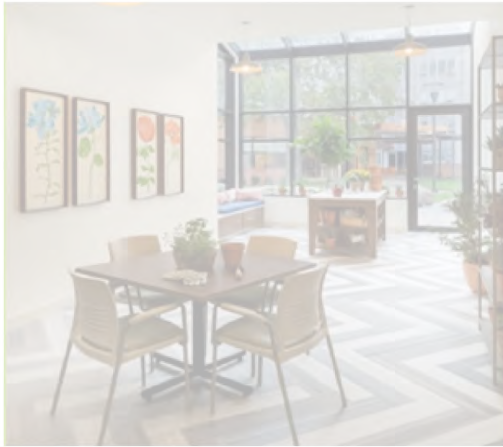
Abe's Garden Conservatory

The private, zero barrier entry bathroom accommodates the turning radius of wheelchairs and space for care partners to manoeuvre while assisting residents.