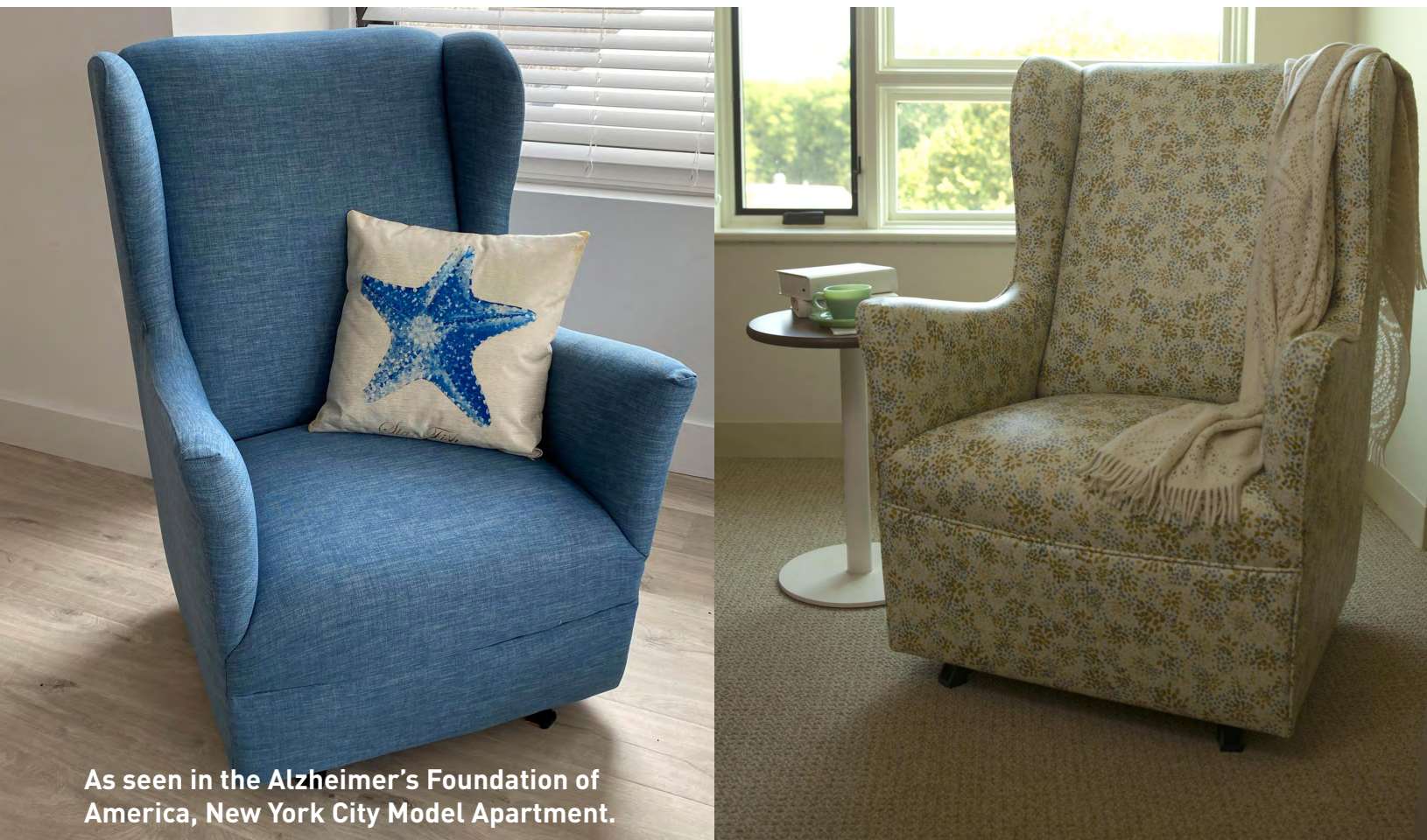
As seen in the Alzheimer's Foundation of America, New York City Model Apartment.

Chair can be ordered with legs instead of gliding mechanism.