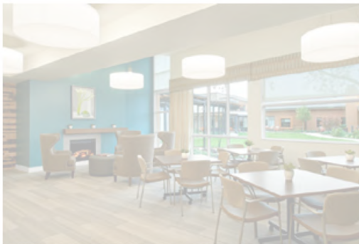
Abe's Garden The Club

While certain decorative elements are art-themed in this household to promote creativity and help with wayfinding, its core elements are replicated in the other two households: an open kitchen, located in slightly varied, but with close proximity to residential suites to activate sense of smell and cue mealtime; somewhat contemporary, yet familiar homelike environments, including a living room and flexible spaces for dining and other engagement; small, intimate nooks to provide places of respite for residents and visitors; courtyard views; clerestory and floor-to-ceiling windows that provide ample natural light.