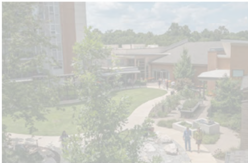
Abe's Garden Central Courtyard

The centrepiece of Abe's Garden's residential memory care community is a well-planned, secure and stimulating, central courtyard that is easily accessible from each household, providing residents the opportunity to independently interact with nature. The courtyard has several engagement areas, including a walkway, outdoor kitchen, raised garden beds, hummingbird feeders, and a water feature. Weather permitting, residents are invited to engage there daily.