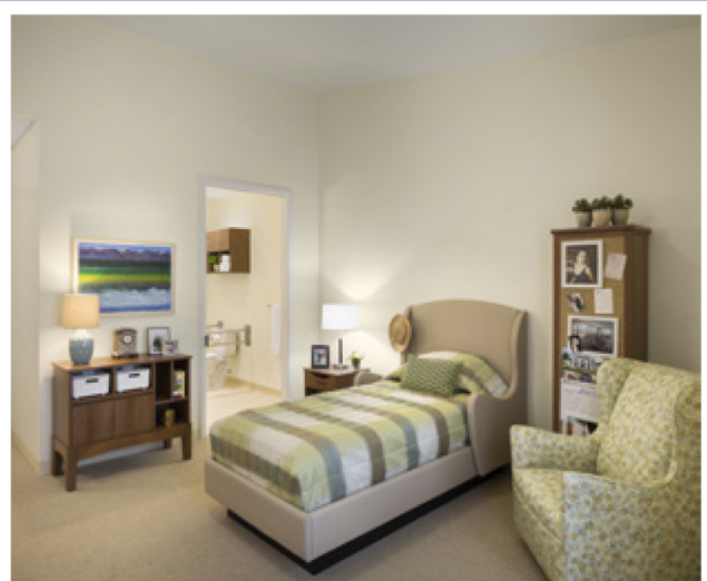
Abe's Garden Memory Care Residential Suite – Copyright Sarah Mechling Courtesy Perkins Eastman.

While certain decorative elements are art-themed in this household to promote creativity and help with wayfinding, its core elements are replicated in the other two households: an open kitchen, located in slightly varied, but with close proximity to residential suites to activate sense of smell and cue mealtime; somewhat contemporary, yet familiar homelike environments, including a living room and flexible spaces for dining and other engagement; small, intimate nooks to provide places of respite for residents and visitors; courtyard views; clerestory and floor-to-ceiling windows that provide ample natural light.