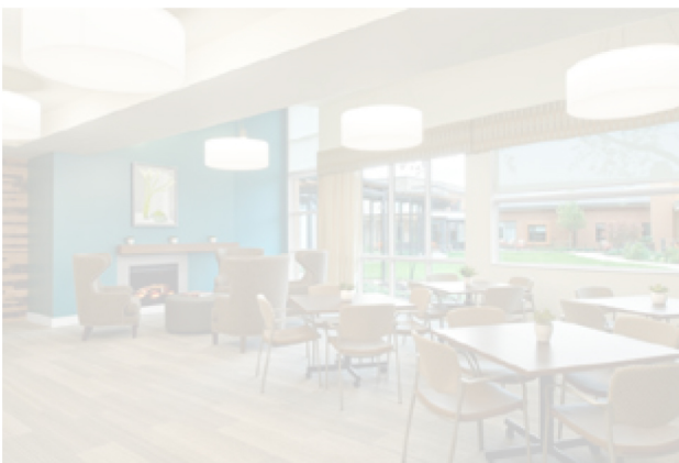
Abe's Garden The Club

The centrepiece of Abe's Garden's residential memory care community is a well-planned, secure and stimulating, central courtyard that is easily accessible from each household, providing residents the opportunity to independently interact with nature. The courtyard has several engagement areas, including a walkway, outdoor kitchen, raised garden beds, hummingbird feeders, and a water feature. Weather permitting, residents are invited to engage there daily.