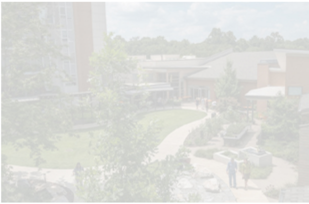
Abe's Garden Central Courtyard

The centrepiece of Abe's Garden's residential memory care community is a well-planned, secure and stimulating, central courtyard that is easily accessible from each household, providing residents the opportunity to independently interact with nature. The courtyard has several engagement areas, including a walkway, outdoor kitchen, raised garden beds, hummingbird feeders, and a water feature. Weather permitting, residents are invited to engage there daily.